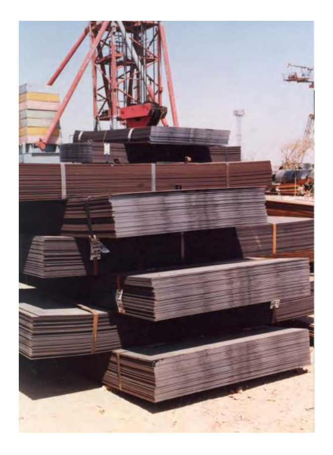
Photograph D for Question 4