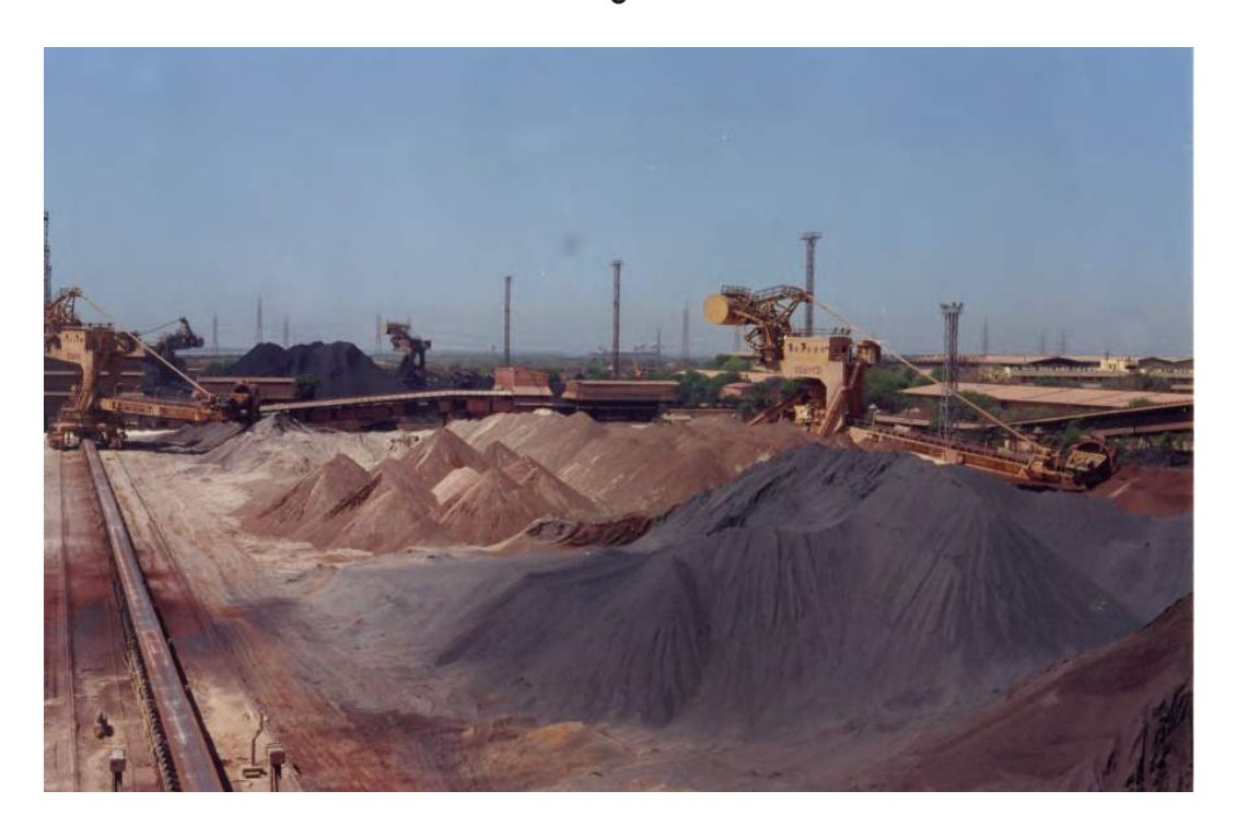
Photograph C for Question 4