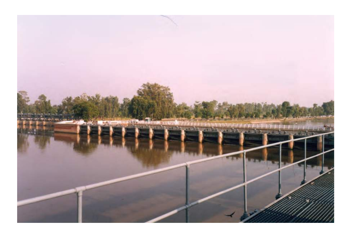
Photograph B for Question 1